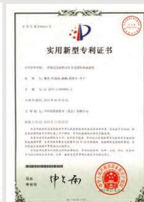
PATENT NO: 4786313