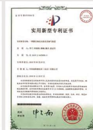
PATENT NO: 5737034