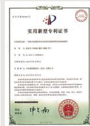
PATENT NO: 5870293