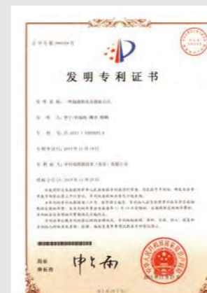
PATENT NO: 1846354