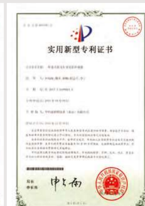
PATENT NO: 4899381