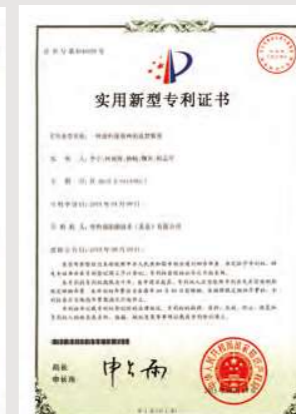
PATENT NO: 4545079