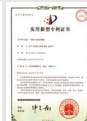
PATENT NO: 4775194