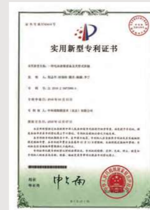
PATENT NO: 5743414

Trademark RisingSun Membrane SUN (picture)