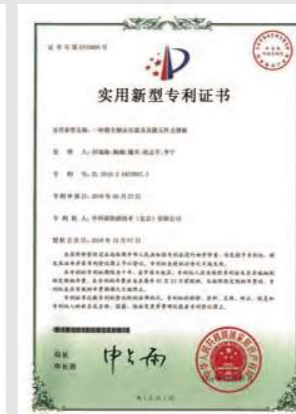
PATENT NO: 5753820