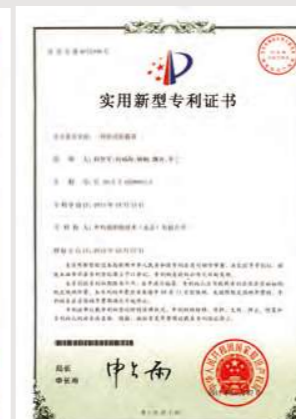
PATENT NO: 4671308