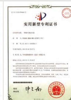
PATENT NO: 4766844